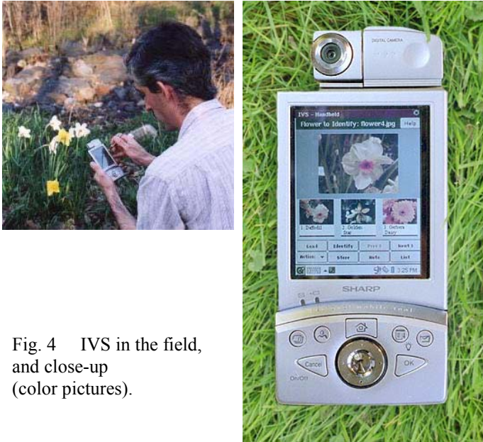
Fig. 4 IVS in the field, and close-up (color pictures).

Information Device Profile) that runs on low-end PDAs and cell phones. As an indication of the rapid advance of the technology, the Zaurus SL-5500 has already been superseded by the SL-6000 and the Ipaq 38xx series by the hx series, with 400MHz and 624MHz processors respectively.