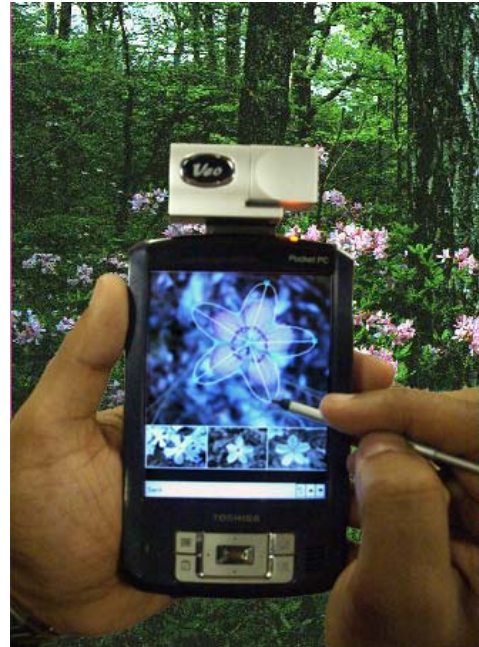
Fig 5 M-CAVIAR GUI.

candidates using its stored reference images, and returns the model parameters and index numbers of the top candidates to the PDA. The PDA then displays the top three candidates from its stored database of thumbnail reference pictures.