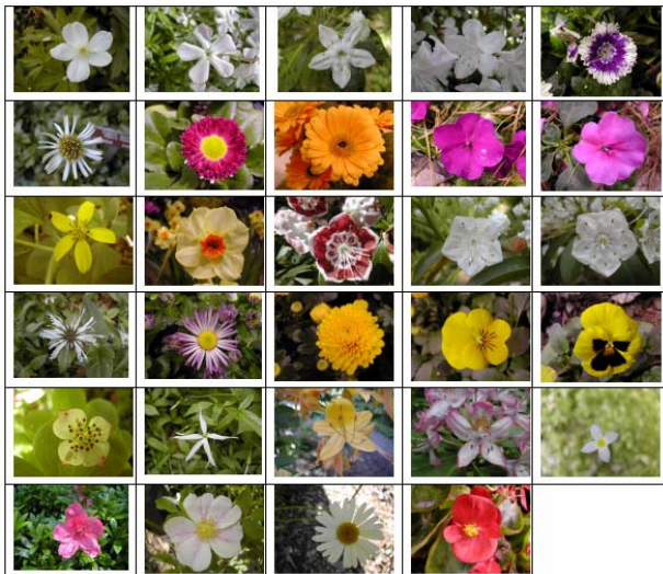
Fig 6 Development database of 29 species.

For flower recognition, CAVIAR offers model-based automated and interactive segmentation, shape features based on moment invariants, hue and saturation histogram features, and an optimized Nearest Neighbor classifier [Nagy02]. Its browser can display not only alternative species, but also other instances of the same species. In anticipation of the port to a handheld, the CAVIAR window was restricted to 370 x 300 pixels. The simplicity of the interface draws on decades of HCI research by others [Myers99, Duric02].