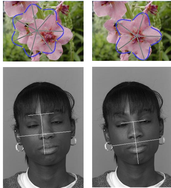
Fig 3 CAVIAR-Flower model (top) and CAVIAR-Face model (bottom): left, before adjustment; right, after adjustment by the operator. Here the automated model construction was confused by nearby flowers, and by closed eyes, respectively.