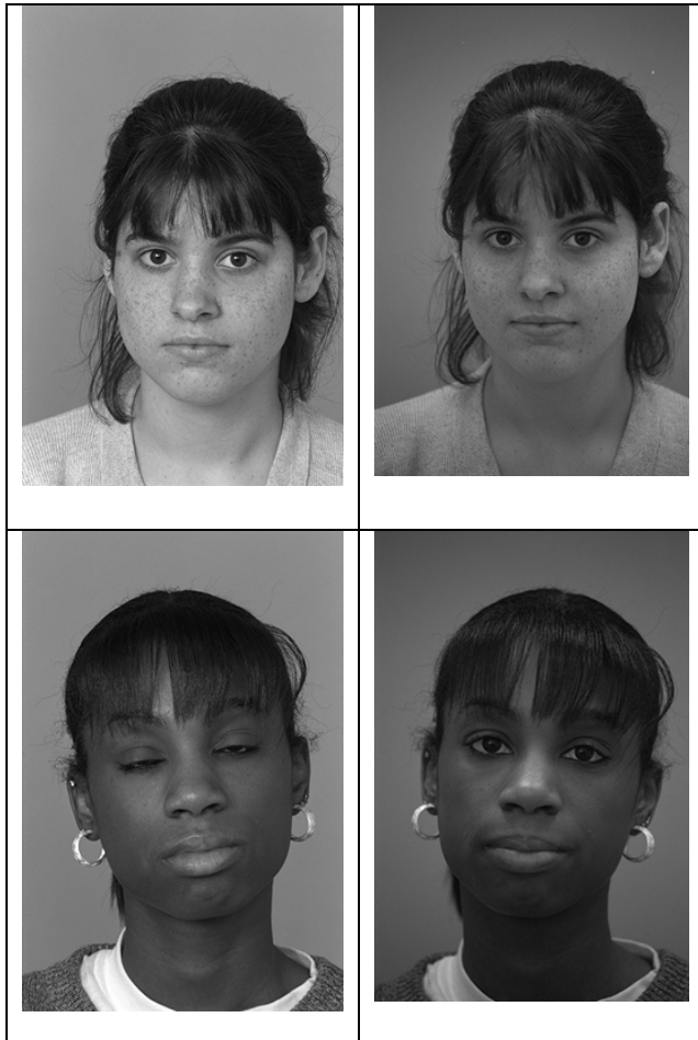
Fig 7 Easy and difficult Feret pairs.

the visible model. The reflectance values are subjected to local histogram equalization over a window four times as large as the templates (on the FERET database, this proved far superior to global intensity normalization). Discriminative locations for templates are obtained from the training set: many are near the eyebrows. The candidates are ranked according to the Borda Count of their match scores [Ho94]. As will be seen below, more match scores are computed for difficult faces.