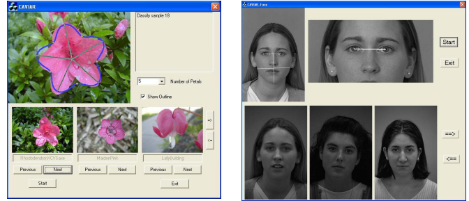
Fig 2 Desktop GUIs for CAVIAR-Flower (left) and CAVIAR-Face (right)

Pictures of just-classified objects can be added to the reference database along with their operator-assigned labels, and their visible models. They are subsequently used to improve model construction and rank ordering through decision-directed approximation [DHS00].