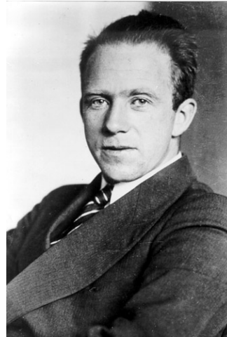
Werner Heisenberg (1901–1976) Established uncertainty principle