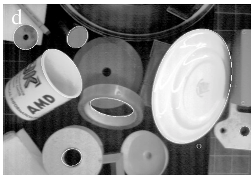
Figure 3. Results on real world images, with detected ellipses superimposed.